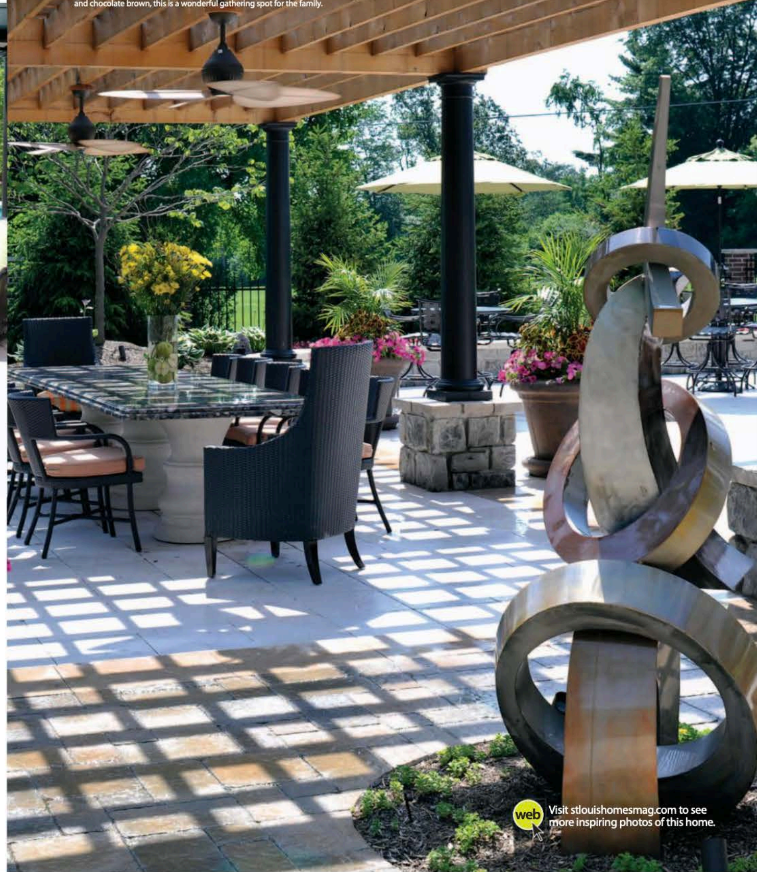
A pergola provides a handsome architectural canopy for alfresco dining, while a 12-foot custom river rock granite table is the centerpiece of this large gathering area. Chosen for color, texture and balance, plant materials include Liriope, palms, petunias, coleus, geraniums, pansies (in the fall), sweet potato vine and Vinca minor. Plants are changed seasonally to provide continuous color and interest throughout the year. Opposite: A capacious semicircular sofa begs guests to sit down and stay awhile. Overflowing with pillows in rich yet mellow shades of apple green, melon and chocolate brown, this is a wonderful gathering spot for the family.

Indeed, it couldn't get any better than this. And then you walk outside. "Wow" is really the only word that comes to mind as you suddenly realize that the party has only just begun. The finale could not be more expressive. A breathtaking complement to their home, the resort-like paradise that unfolds exquisitely melds the indoor and outdoor spaces. "We wanted to be able to take full advantage of every part of our home, inside and out," says Diane. "We love how our home flows easily to the pool deck, lower patio and gardens."